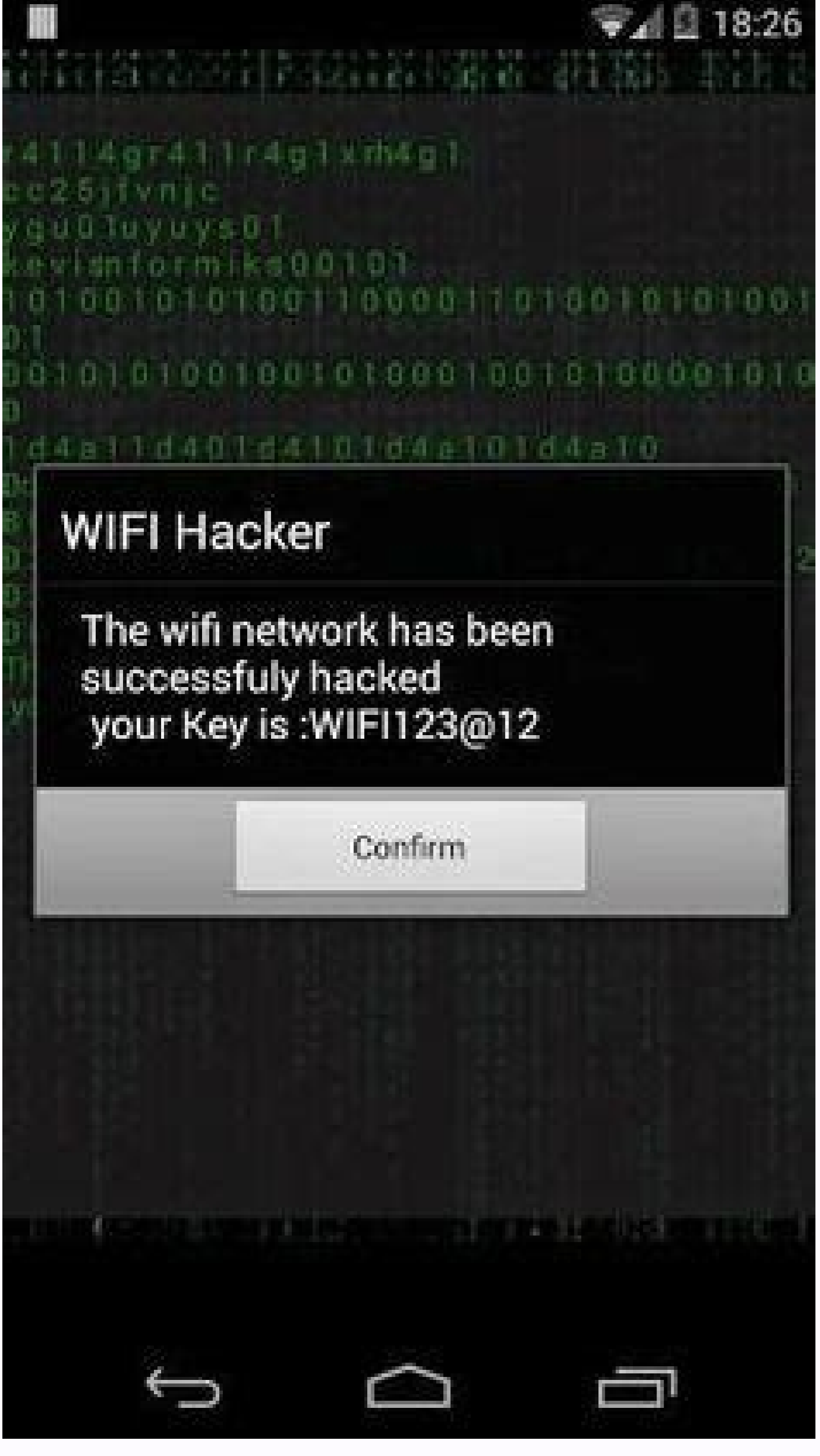
Cài kali linux trên win 10. Kali hanoi. Kali linux là gì. Hướng dẫn sử dụng kali linux.